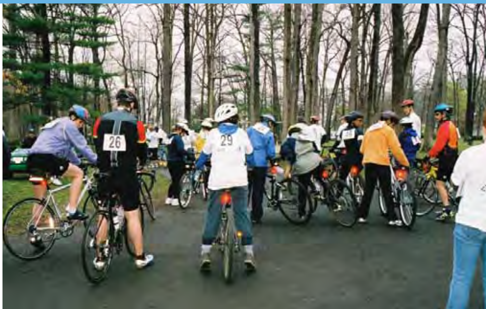
Bikes approach the starting line.