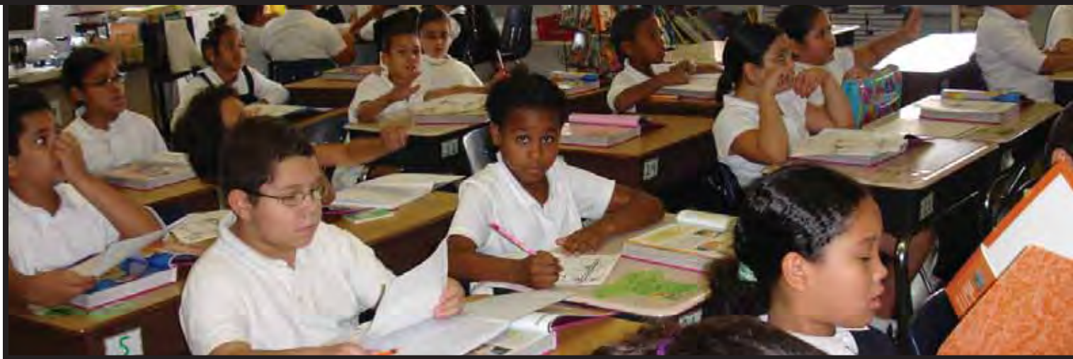
Students at the Isaac Sheppard Elementary School in Philadelphia, the site of Penn State's new Urban Teaching Collaborative.