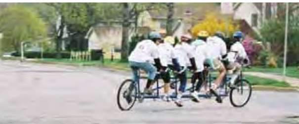
The Penn State Six Pack negotiates a turn.