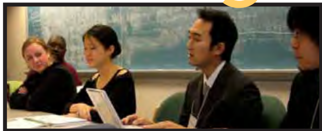
Visitors from Tokyo University attend a graduate seminar in the College of Education.