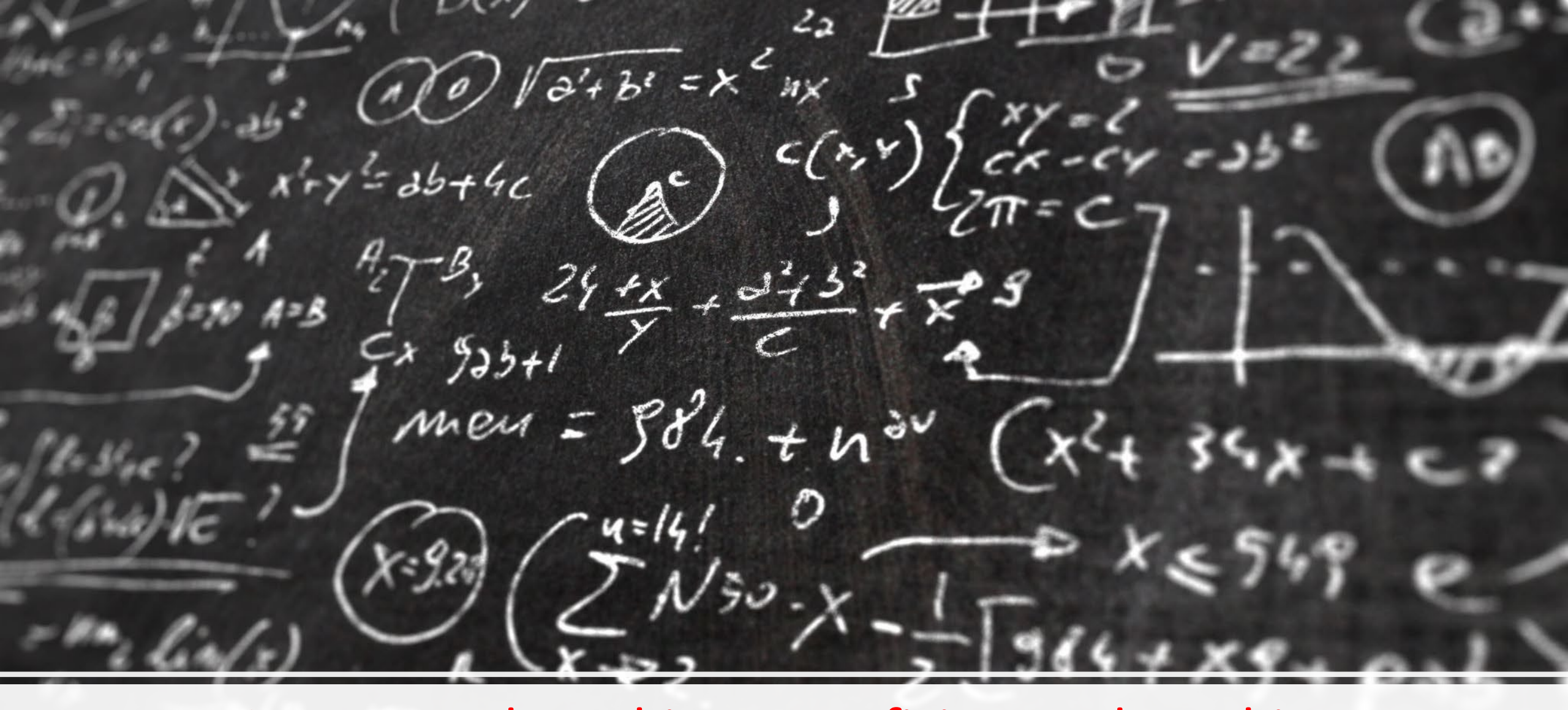
Asset-Based Teaching vs. Deficit-Based Teaching