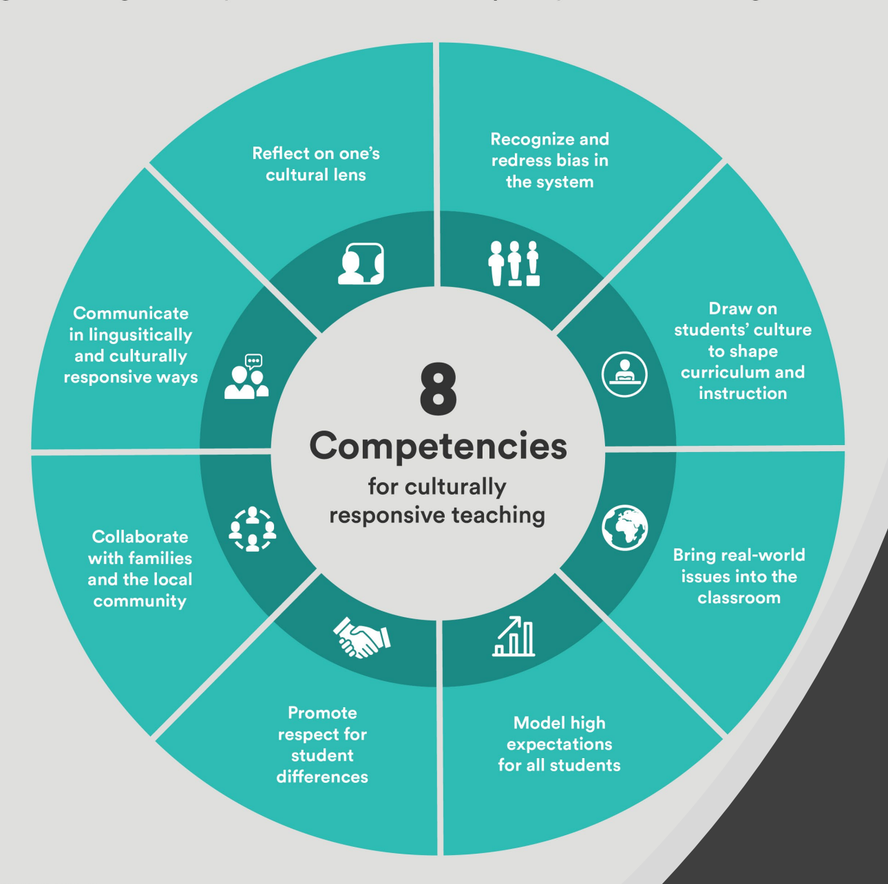
Figure 1 | Eight Competencies for Culturally Responsive Teaching